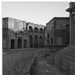
Hope Sprouting Amid Studio's Decay