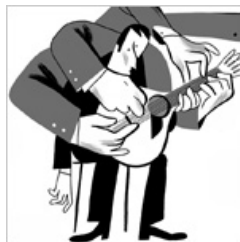
Op-Ed: Portugal's Unnecessary Bailout