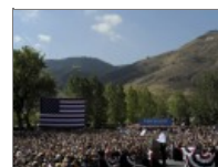
Obama Campaigns In Golden