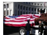
9/11 Remembrance Events In...