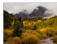
Colorado Fall Colors 2012